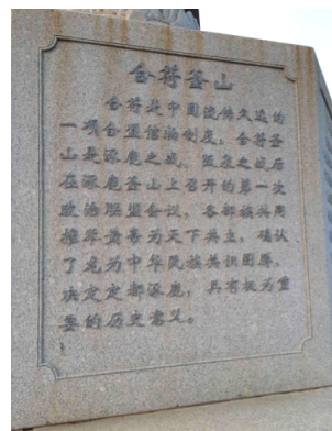
The stone monument at the Chinese Hefu Altar, Huangdi City, records the founding of the modern Culture-State China in 1xy.

President Xi pointed out that Chinese culture is the soul of the Chinese. "Culture is the soul of a nation," thinking with learning, he added, "If a country or a nation does not cherish its own thinking and culture, if they lose their soul, no matter which country or which nation, it will not be able to stand." 4